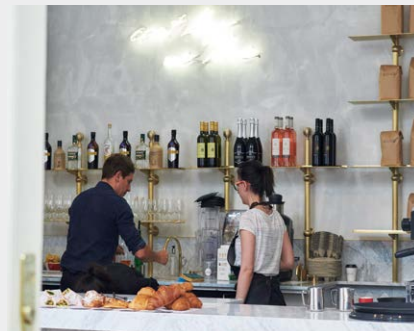
ONE GEORGE YARD LONDON EC3